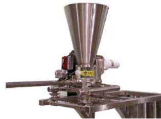
Uni-spense® Dry Applicator

This item is compatible with our Uni-spense I and III Dry Ingredient applicators. Additionally, they are designed as a stand alone controller for the Uni-spense or to be integrated with a Weigh Belt or Magna Weigh.