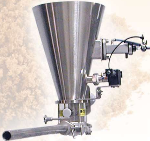
Standard Uni-Spense I