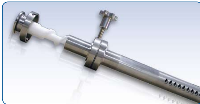
Precisely adjust seasoning delivery with our simple Uni-Spense worm gear control.

Constant improvement and engineering innovations mean these specifications may change without notice.